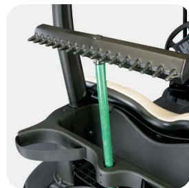
Sand Trap Rake Kit