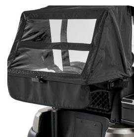
Bag Cover with Magnetic Latch