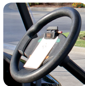
Comfort Grip Steering Wheel