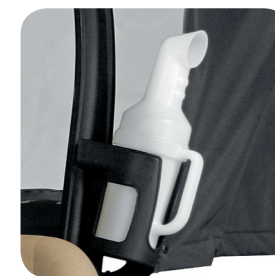
Divot Repair Sand Bottle