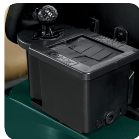
Ball and Club Cleaner