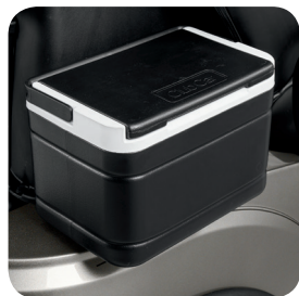
Caddy Master Cooler